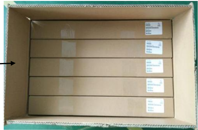
Fig.1- Tube pack for D3K